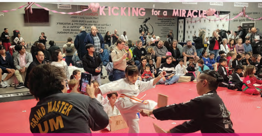
The Kicking for a Miracle board breaking challenge at Golden Eagle Taekwondo raised $7,000 to support women diagnosed with breast cancer.