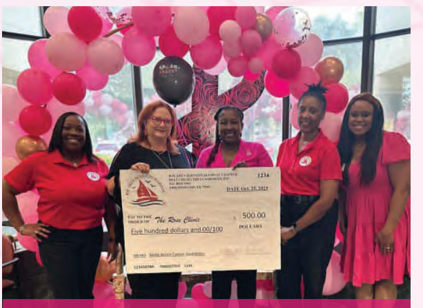
Bay Area Houston Alumnae Chapter, Delta Sigma Theta Sorority, Inc. presented a donation of $500 on October 25, 2023