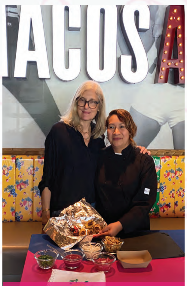
Proceeds from Tacos a Go Go's exclusive pink taco sales helped numerous women receive critical breast cancer screening mammograms.