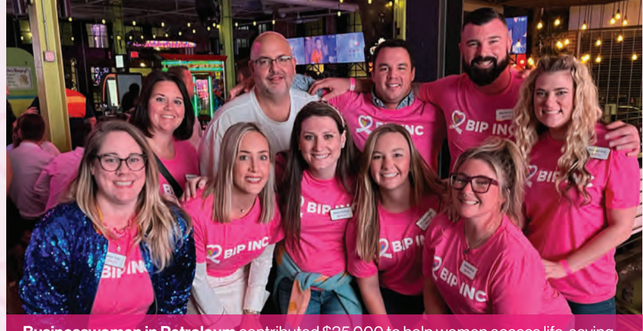
Businesswomen in Petroleum contributed $35,000 to help women access life-saving mammograms and diagnostic care.