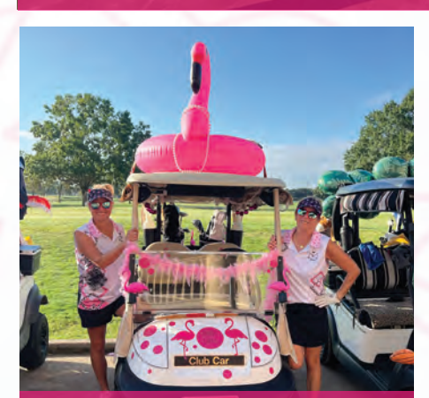
Pretty in Pink Willow Fork Ladies Golf & Tennis Clubs hosted a fundraising tournament for The Rose.