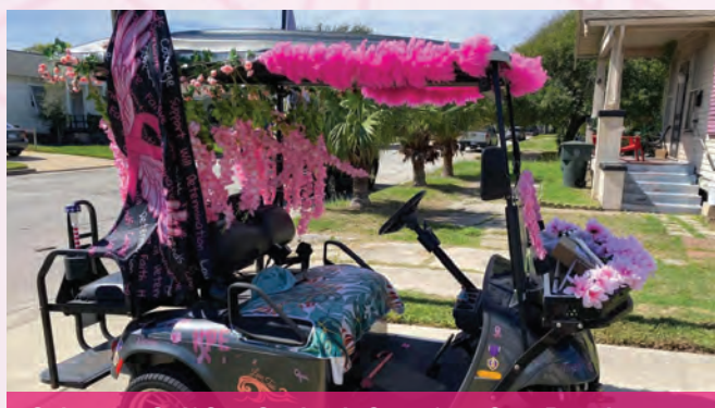
Galveston Golf Cart Society's Carts for a Cure Parade on October 8, 2023 honored survivors and supported The Rose's mission to provide access to care for all.